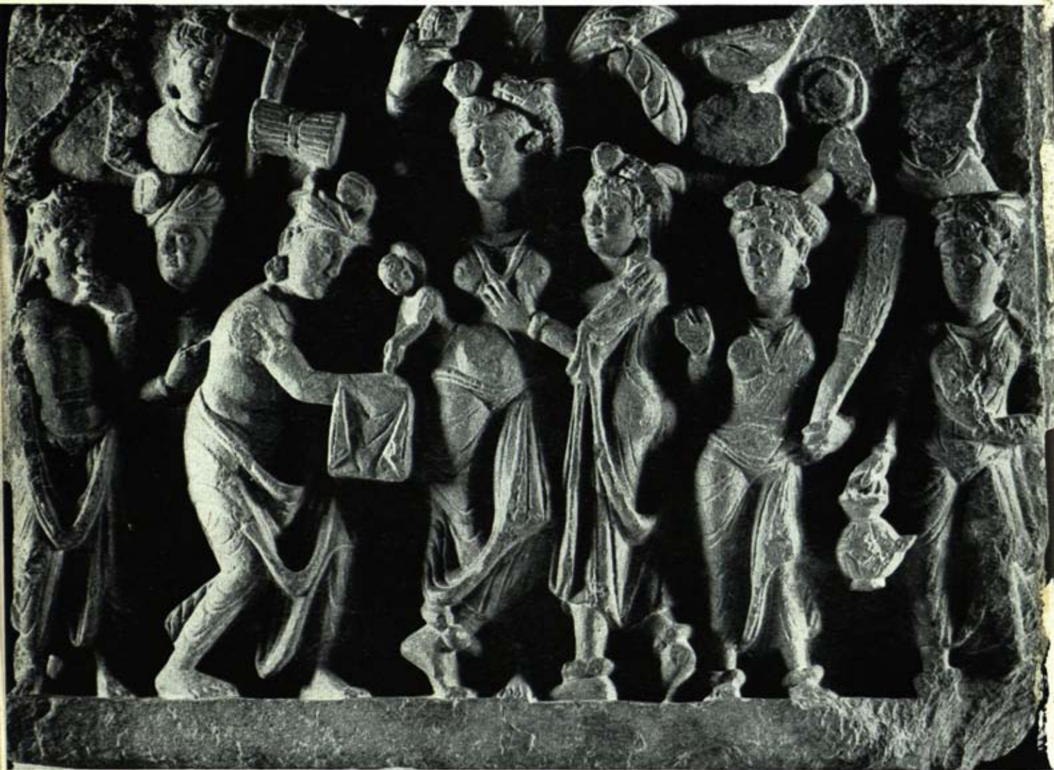
"Birth of Siddhartha", 2nd century, schist, 13 \frac{3}{8} x 17 \frac{3}{4} , Lahore, Central Museum