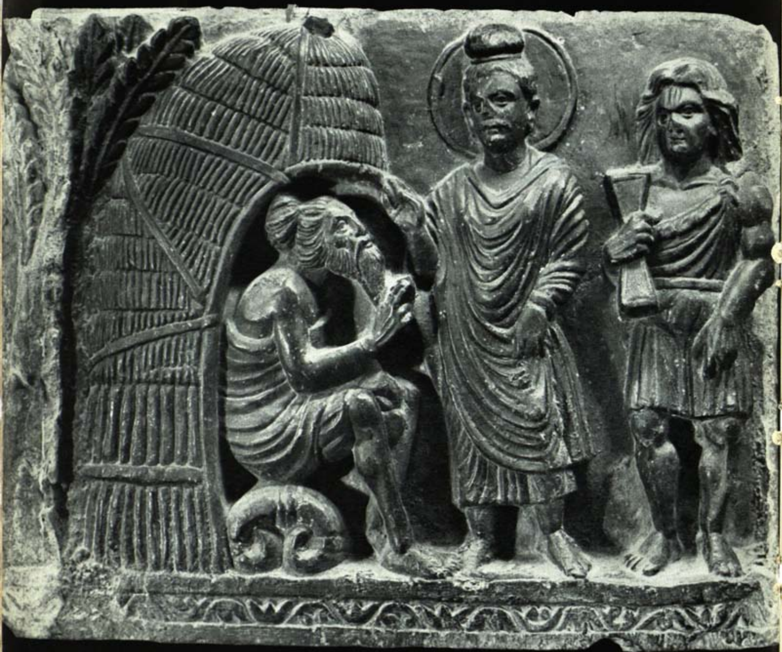
"Sakyamuni's First Meeting with a Brahmin", late 1st century, fine-grained schist, 15½ x 19½, Peshawar Museum