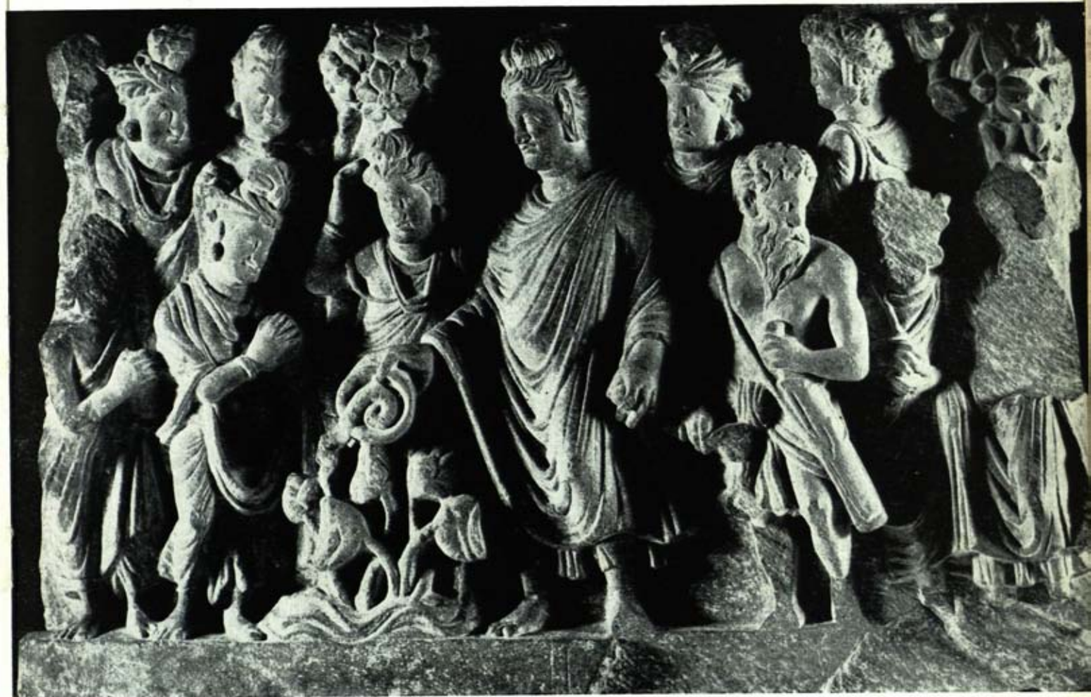
"Buddha and the Black Serpent of Rajagriha", 2nd century, schist, 12½ x 20½, Lahore, Central Museum

within a very few years. The Gandhāra parallels with Roman reliefs continue with the appearance of the deeply undercut illusionistic technique developed in Rome under the Antonines and Severids (ca. 138-217 A.D.) (page 28) if the very earliest of these styles reached Gandhāra in the last quarter of the 1st century A.D. through the intervention of Roman journeymen