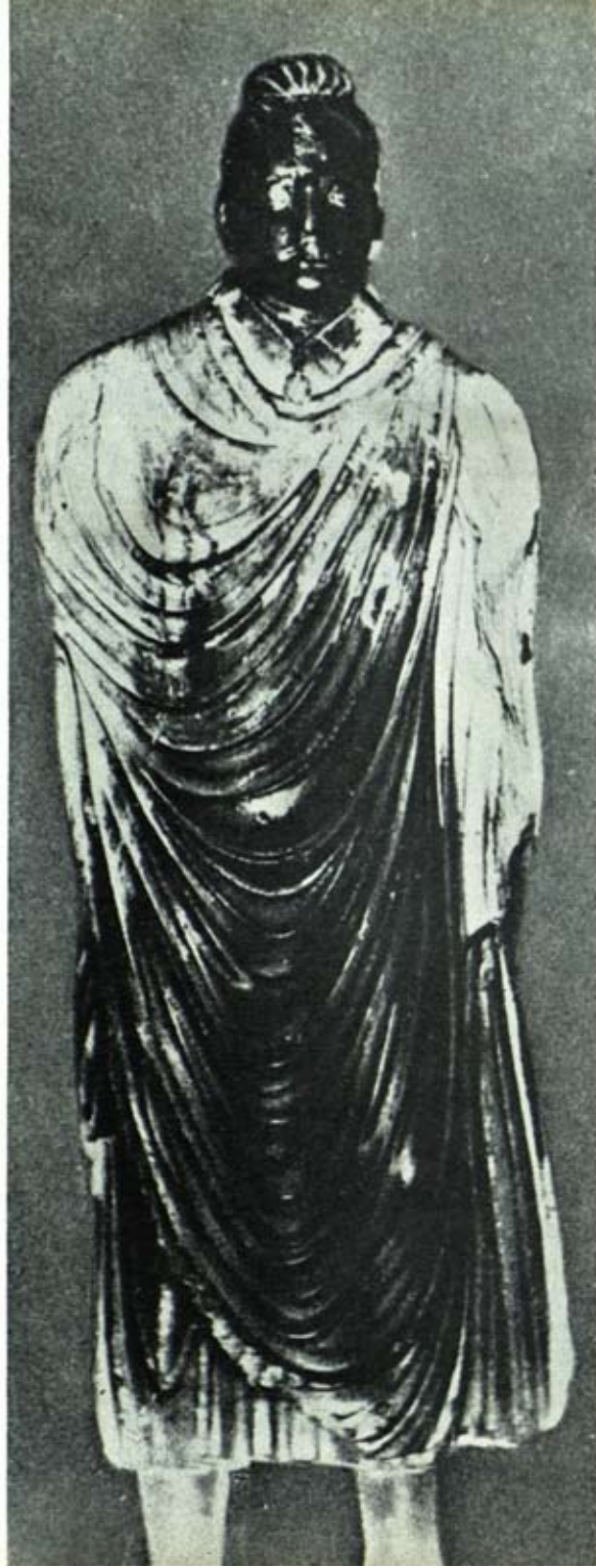
Fig. 7b: Buddha, from Charsada, Hashtnagar, Pakistan