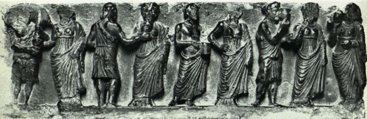
Group of Donors, (stair-riser), 1st century, from the Guide's Mess at Hoti Mardan, steatite, 5½ x 17½. Peshawar Museum