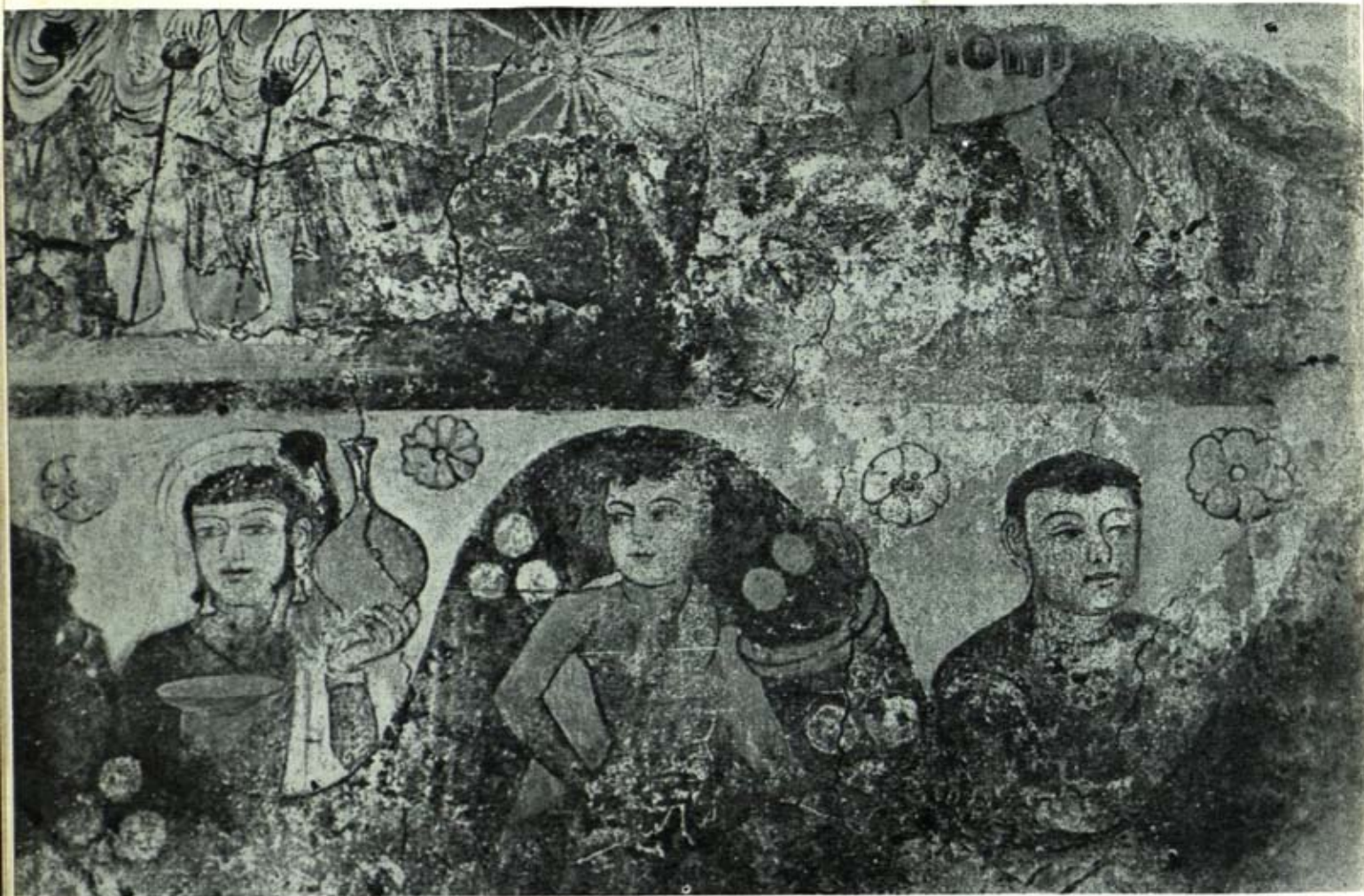
Fig. 12: Wall-painting from Miran, Central Asia, 3rd century, Museum of Central Asian Antiquities, New Delhi