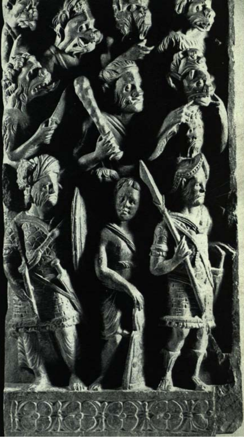
"The Host of Mara", 2nd century, fine-grained schist, 22 \frac{3}{8} x 10 \frac{1}{8} , Lahore, Central Museum