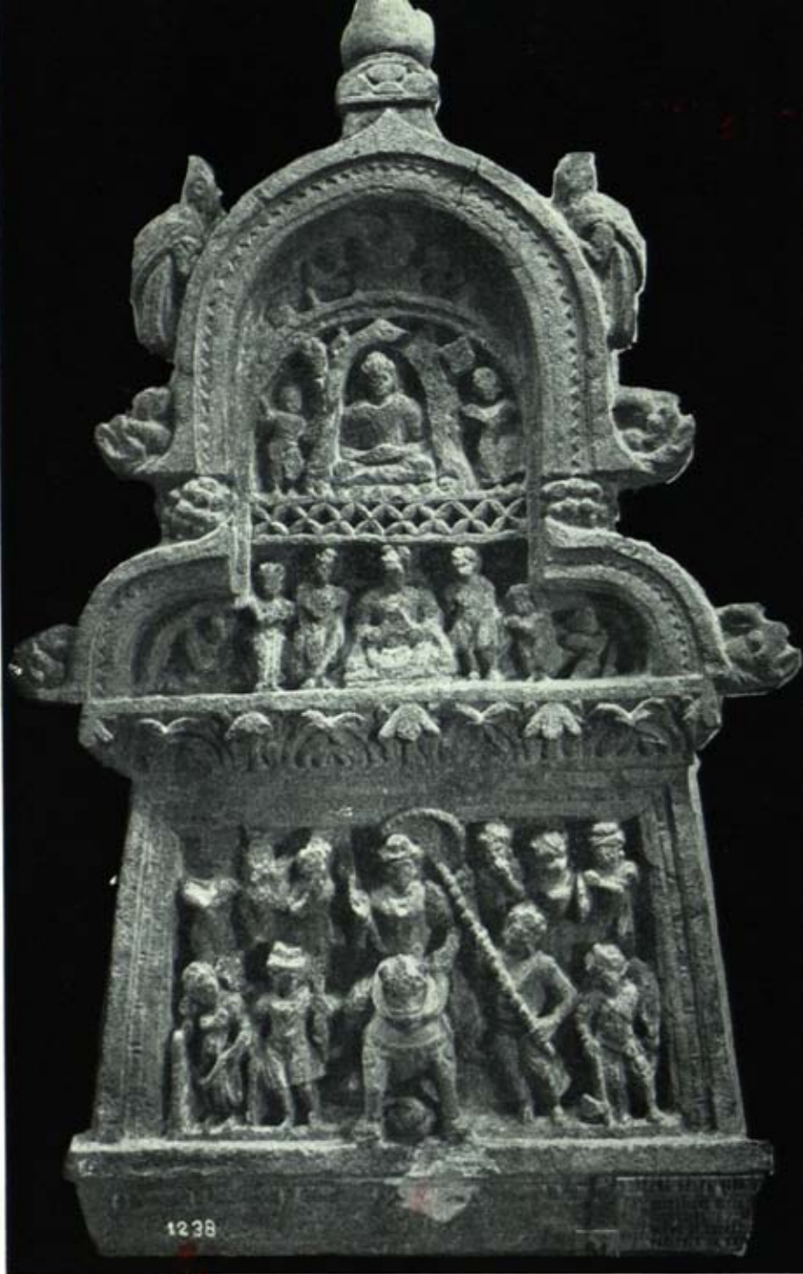
False gable, 2nd-3rd century, schist, 28½ x 16½, Lahore, Central Museum