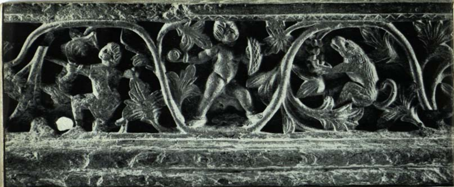
Frieze, with inhabited grapevine pattern, 2nd-3rd century, schist, height: 7", Peshawar Museum

and craftsmen, the latest style presumably made its appearance towards the close of the 2nd century A.D.