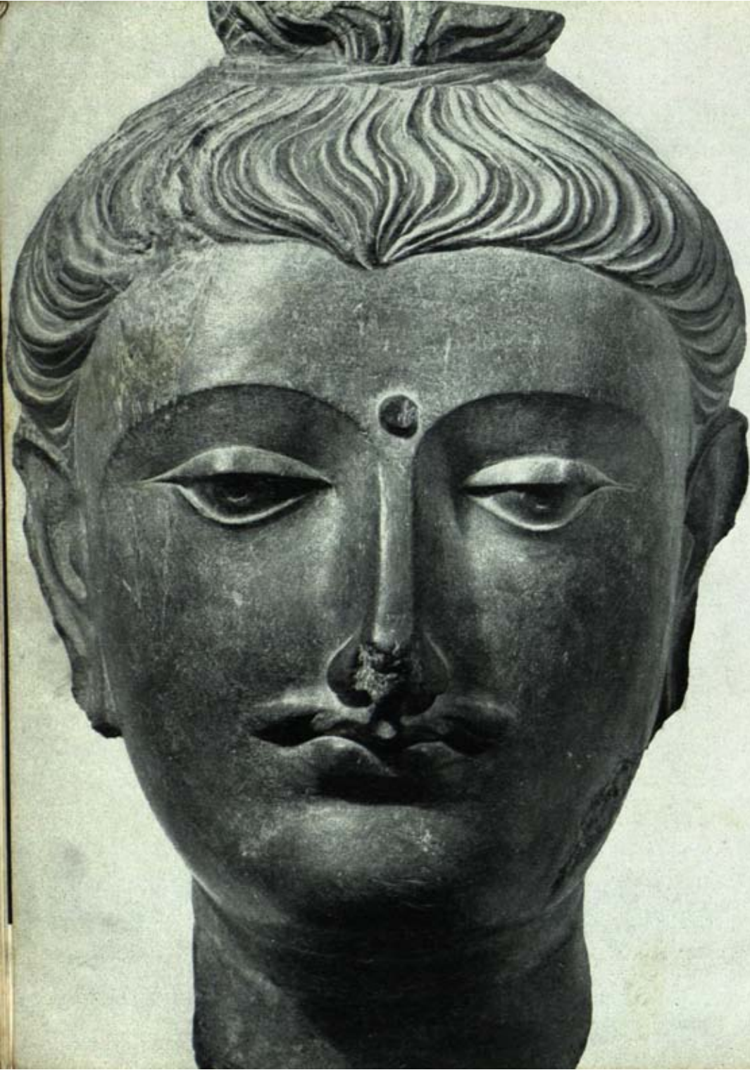
Colossal head of Buddha from Sikri, 2nd century schist, height: 16" Lahore, Central Museum