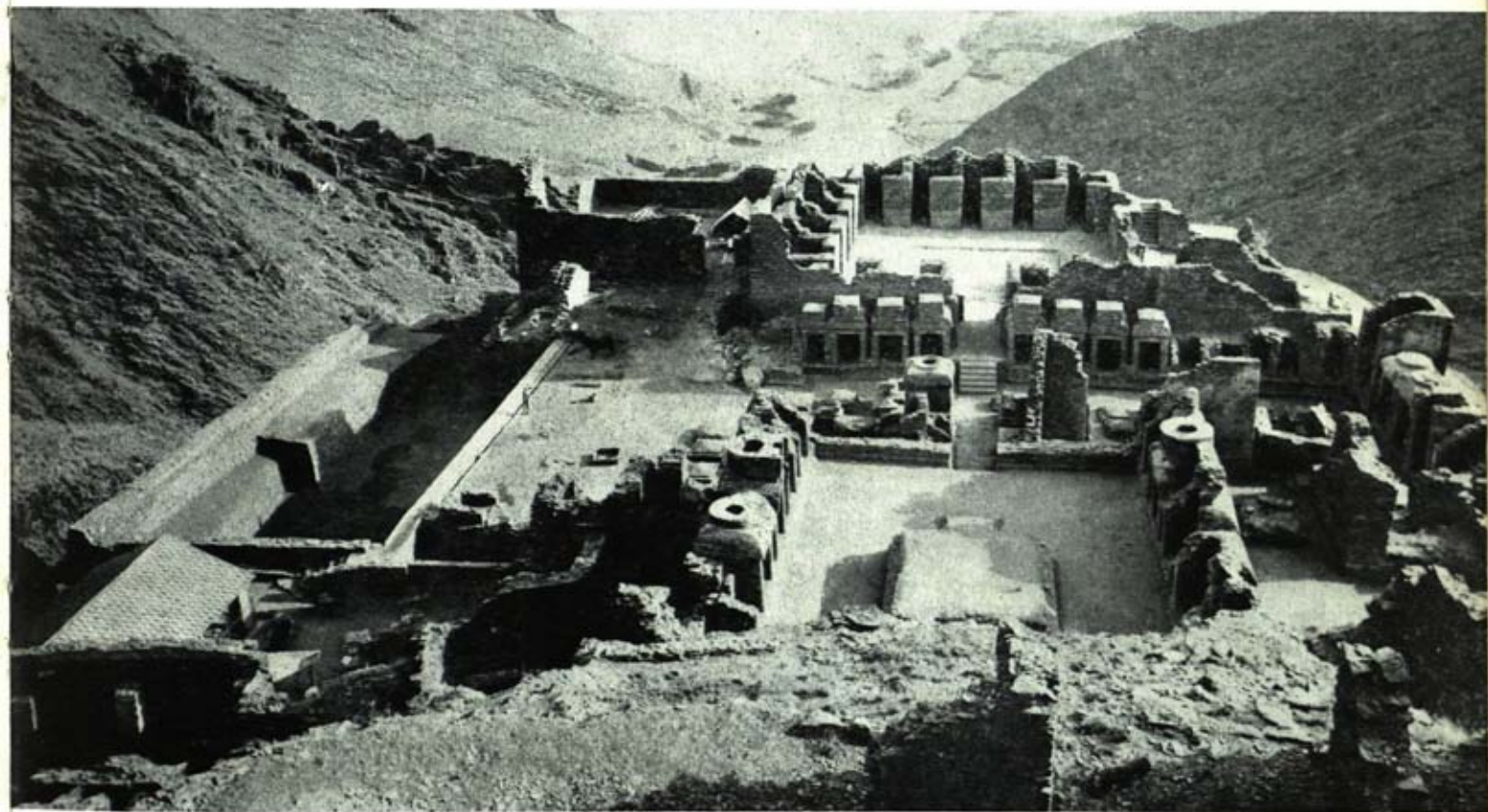
Fig. 2: Monastery of Takht-i-Behi near Peshawar, Pakistan

under the direction of the famous archaeologist, Sir John Marshall. These pieces (page 46) come from the Parthian and Early Kushan strata, so that according to Sir John Marshall's chronology it is possible to date them in the 1st and early 2nd centuries A.D. A few other objects, notably the beautiful head of a Bodhisattva (page 47), were unearthed at Chārsada nearly 60 years ago. This famous site near Peshawar, which has been the object of recent excavations directed by Sir Mortimer Wheeler, 4 was the ancient Pushkalāvati, besieged by Alexander in 327 B.C. and