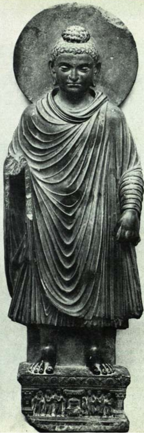
Standing Buddha 2nd century schist, height: 55½" Lahore, Central Museum