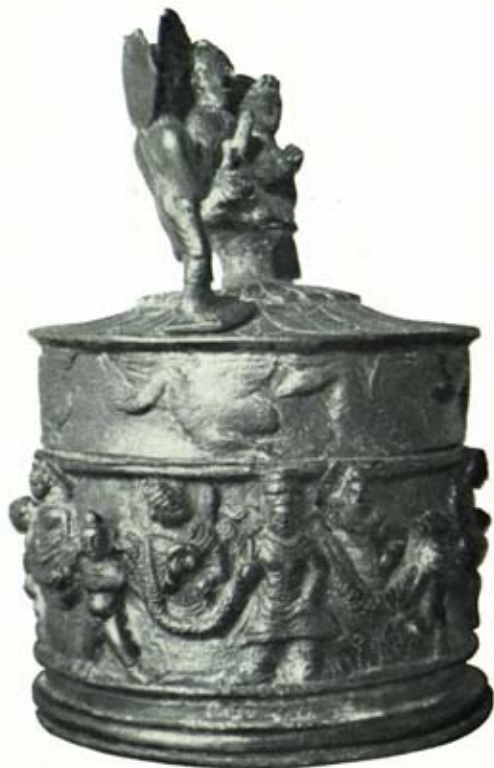
Fig. 9: Reliquary of King Kanishka, late 2nd century, Peshawar Museum

No less famous is the reliquary of Kanishka, found in the ruins of the famous stupa-pagoda erected by that monarch at the site of Shāh-jī-kī-dherī near Peshawar. (fig. 9) 16 The Kanishka reliquary is a metal box in the shape of a pyxis surmounted by freestanding figures of the Buddha and two Bodhisattvas on lotuses mounted on the lid. Around the side of the lid and the drum of the box are two zones of ornament comprising hamsa and erotes carrying a garland. On one side of the box appears the statue of the divinized Kanishka flanked by the sun and moon. There is also a very mutilated inscription, sometimes translated as referring to the first year of Kanishka's reign. More certain