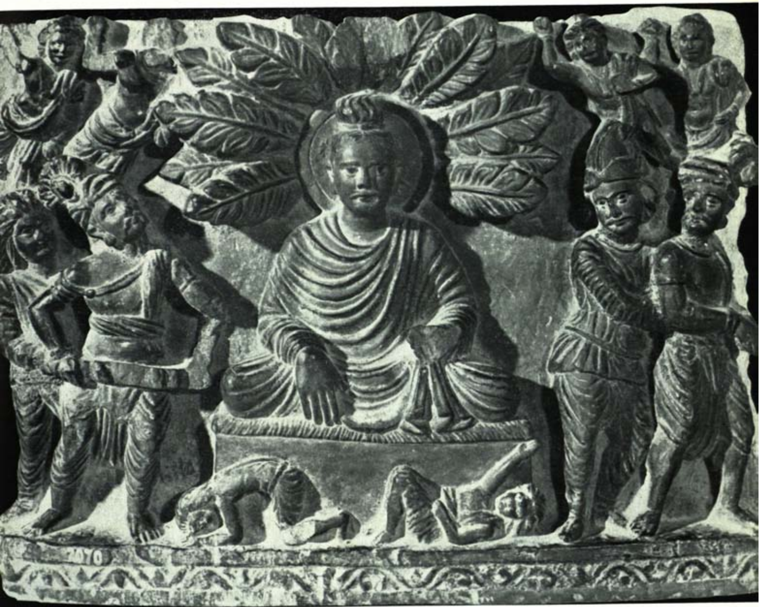
"The Temptation of Mara", late 1st century, schist, 15¼ x 20, Peshawar Museum