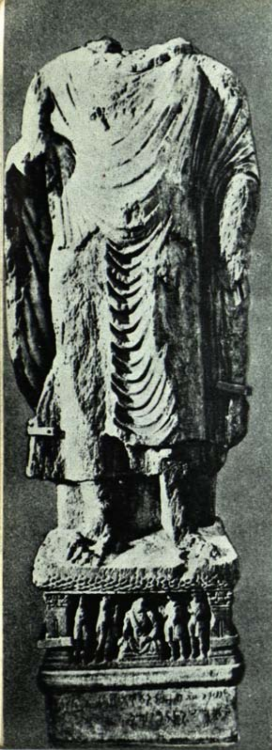
Fig. 7a: Buddha, from Lorian Tangai, Indian Museum, Calcutta