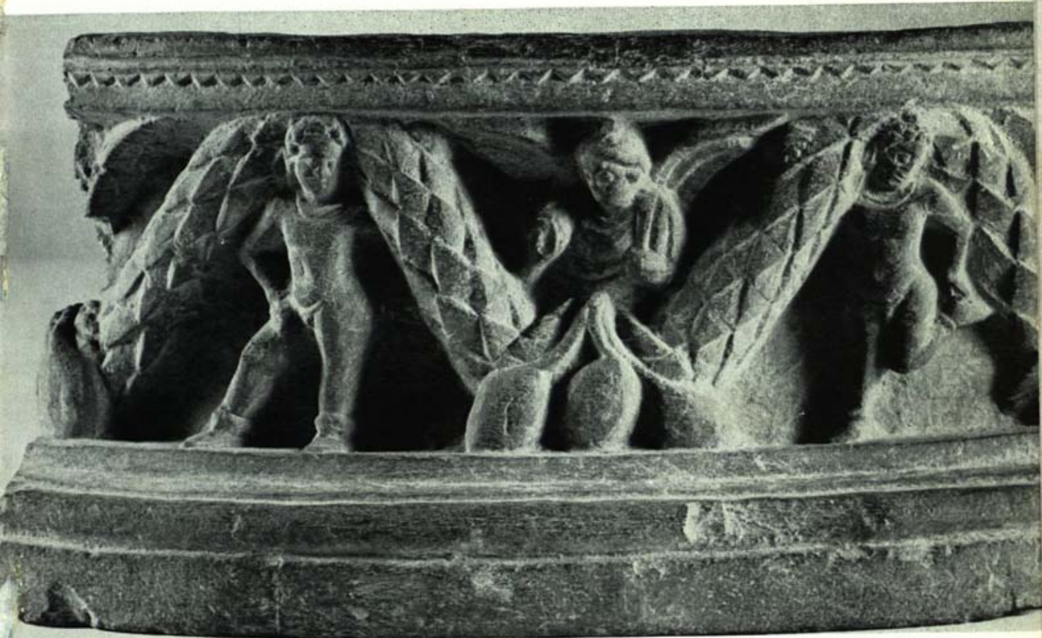
Fragment of a Frieze with Garland-bearing Putti, 2nd century, from Charsada, schist, h: 6½", Lahore, Central Museum