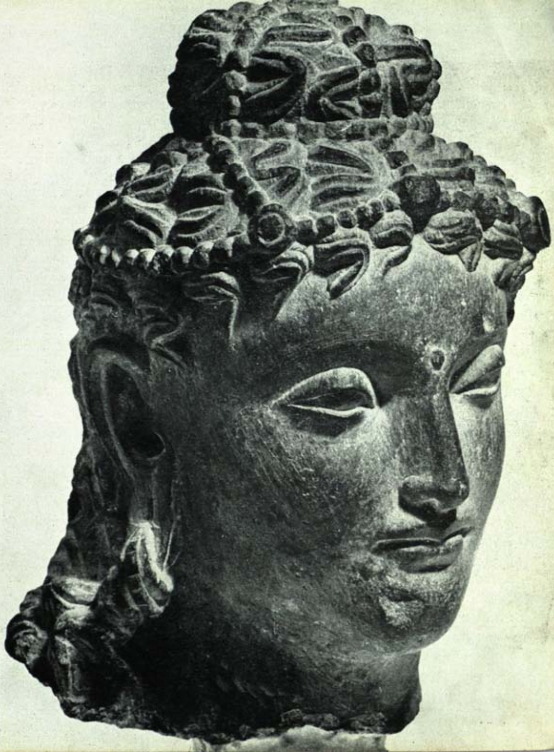
Head of a Bodhisattva early 2nd century from Charsada fine-grained schist height: 5-15/16" Peshawar Museum