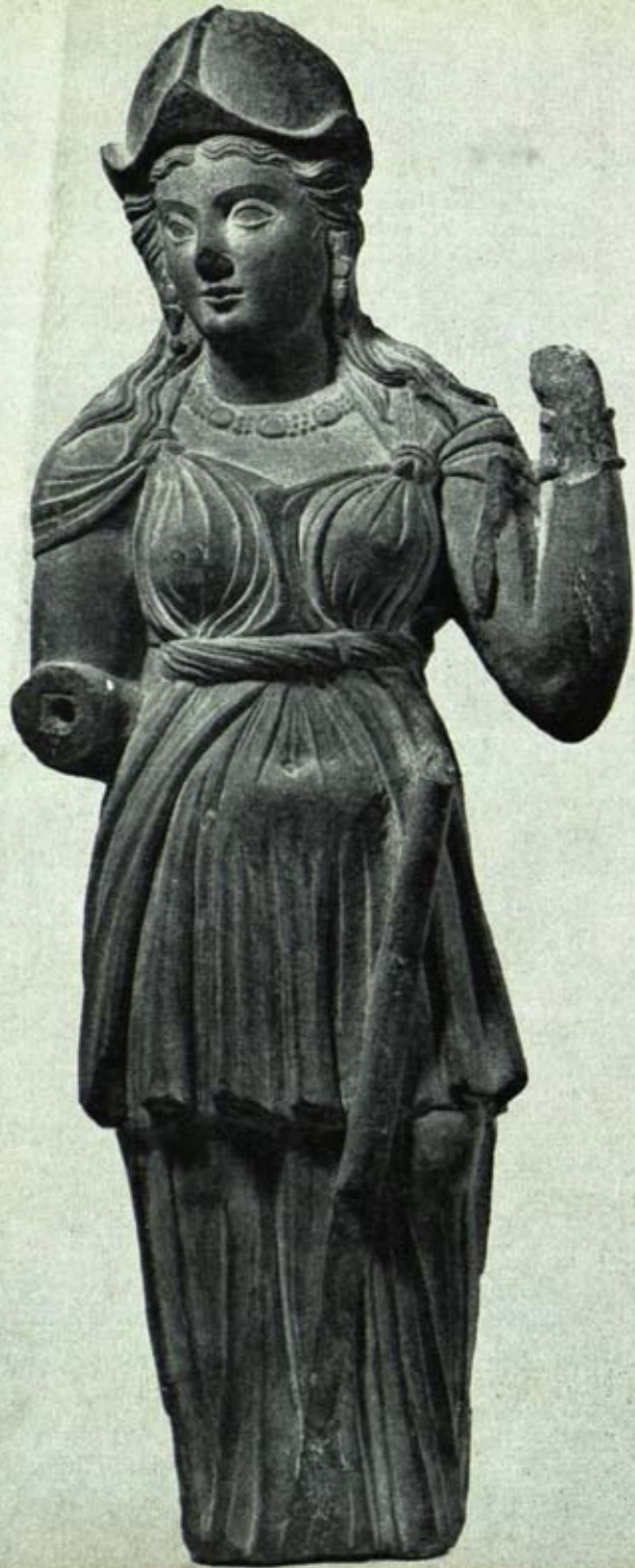
Athena, or Roma, 2nd century, fine-grained schist, height: 32 \frac{3}{4} " Lahore, Central Museum