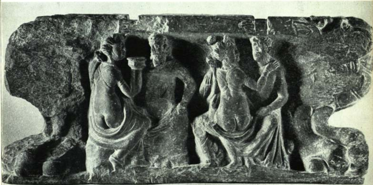
Bacchanal, 2nd century, schist, 9 \frac{3}{8} x 20 \frac{1}{2} , Lahore, Central Museum

The most famous example of the import of pagan types is the so-called Pallas Athena of Lahore (page 10) which may perhaps with even more likelihood be identified as the deified Rome: the goddess Roma appears on the coins of the Kushan emperor Huvishka 27 and her