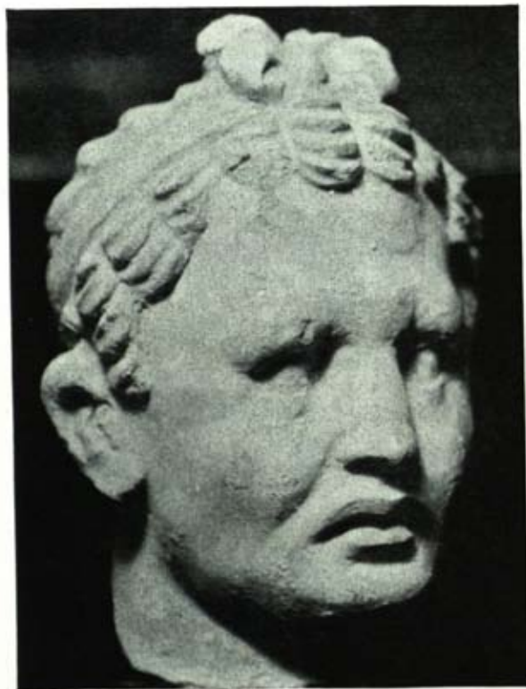
Fig. 10: Head, 2nd-3rd century, stucco, The Nelson Gallery-Atkins Museum, Kansas City

The types of Gandhāra stucco sculpture reflect Hellenistic and Roman precedents just as closely as their counterparts in stone (fig. 10)