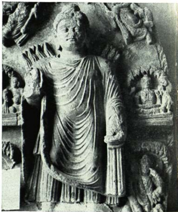
Fig. 4: "Buddha of the Great Miracle", from Begram, 3rd-4th century, Museum, Kabul, Afghanistan

In even later examples, such as the Buddhas from the Begram region in Afghanistan, the robe is only schematically symbolized by a series of stringlike loops descending down the median line of the body. (fig. 4) The representation of