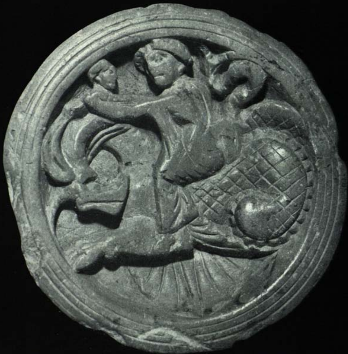
Toilet Tray, 1st century, from Sirkap, Taxila, schist, diameter: 3 1/8", Karachi, National Museum