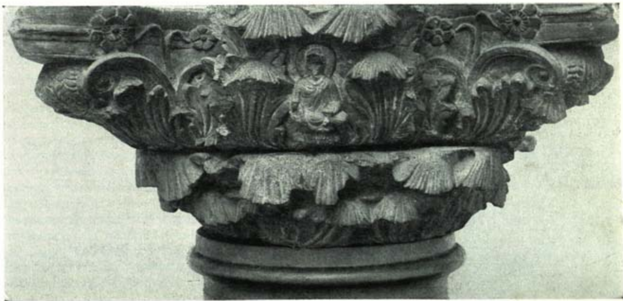
Fig. 13: Corinthian capital, 2nd-3rd century, gray slate, British Museum, London

The main mass of the Gandhāra stupa was generally a conglomerate of rubble and earth, over which was placed a facing of roughly shaped stones with many small courses of stones