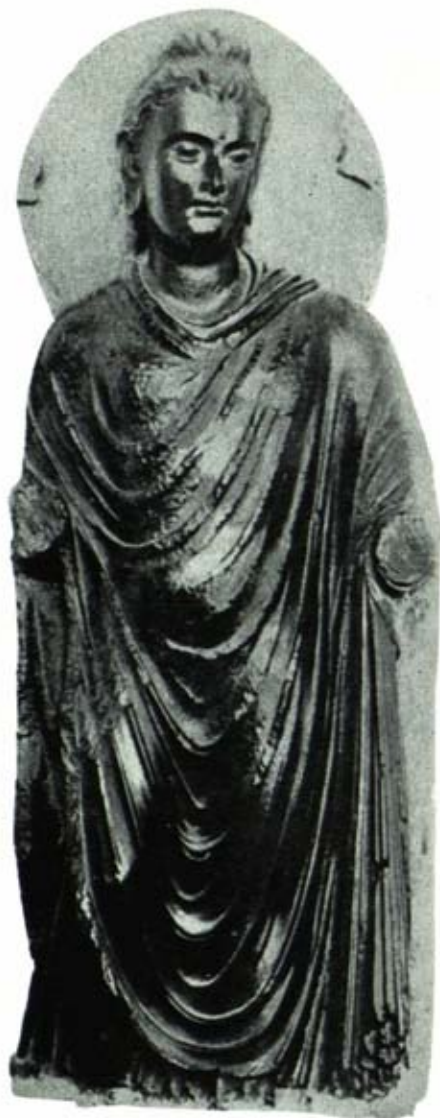
Fig. 3: Buddha, 1st century, (formerly in the Guides Mess, Hoti Mardan, Pakistan)

The standing Buddha image in Gandhāra is not so much an imitation as an adaptation of Western types and techniques by the Roman or Syrian artisans who were called upon to produce these icons. Typical of the very earliest type of Buddha image was a beautiful statue formerly at Hoti Mardan. (fig. 3) The head was apparently suggested by the youthful type of the Apollo Belvedere. The heavy, plastically conceived folds of the drapery, revealing the body, and yet existing as an independent volume, suggest the garments of Roman draped figures from the Claudian through the Flavian periods (ca. 40-100 A.D.) 10 Another early example is illustrated on page 13. The head, although somewhat more schematized than its classical prototype, seems again to derive from the type of the Apollo Belvedere. Such a relationship is also evident in the beautiful head from Chārsada (page 47), as well as in two other heads of Buddha (pages 48 and 49). 11 The drapery of the standing figure from Lahore (page 13) immediately suggests the toga of Roman imperial statues. The folds of the gar-