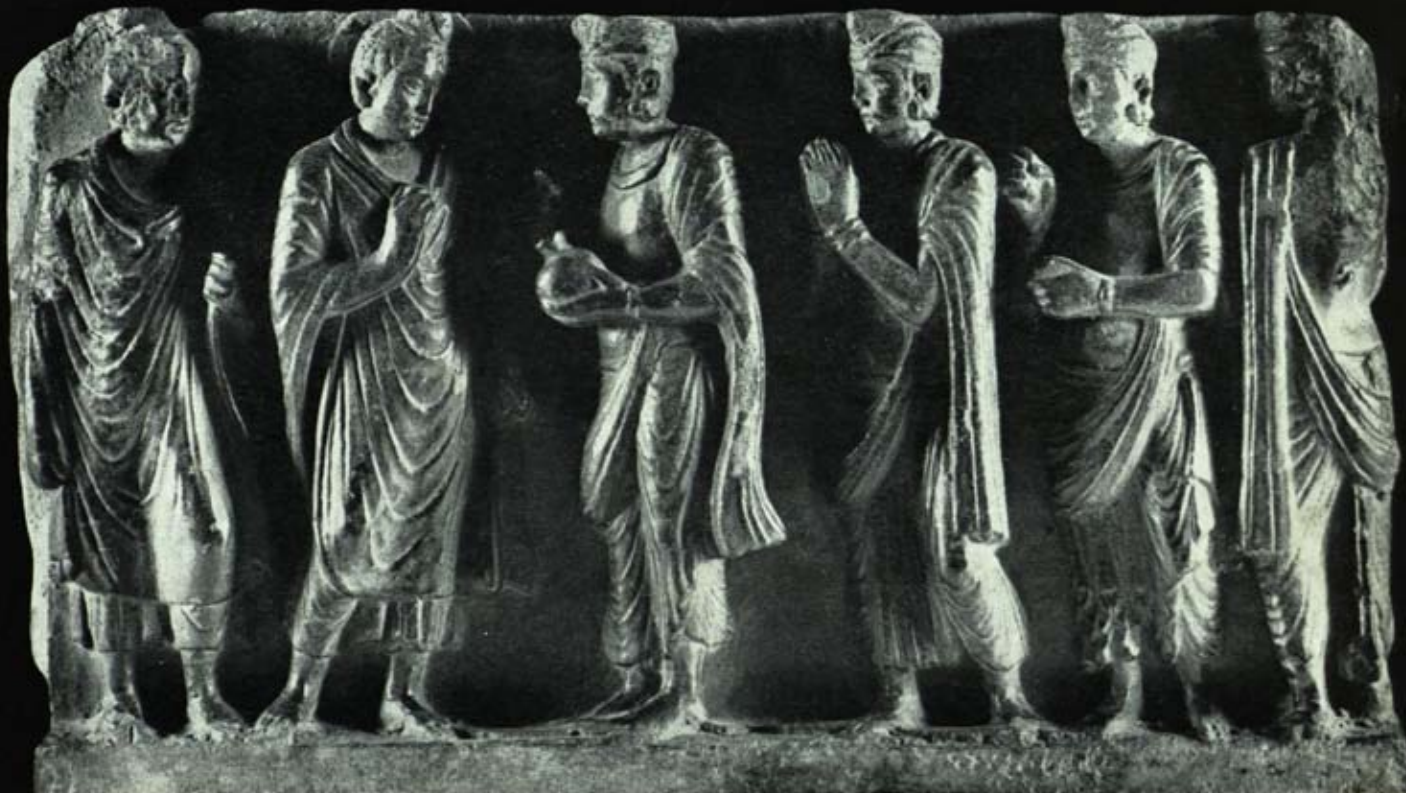
"Anathapindada presents the Jetavana Park to the Buddha", late 1st century, schist, 8 x 13 \frac{3}{4} , Peshawar Museum