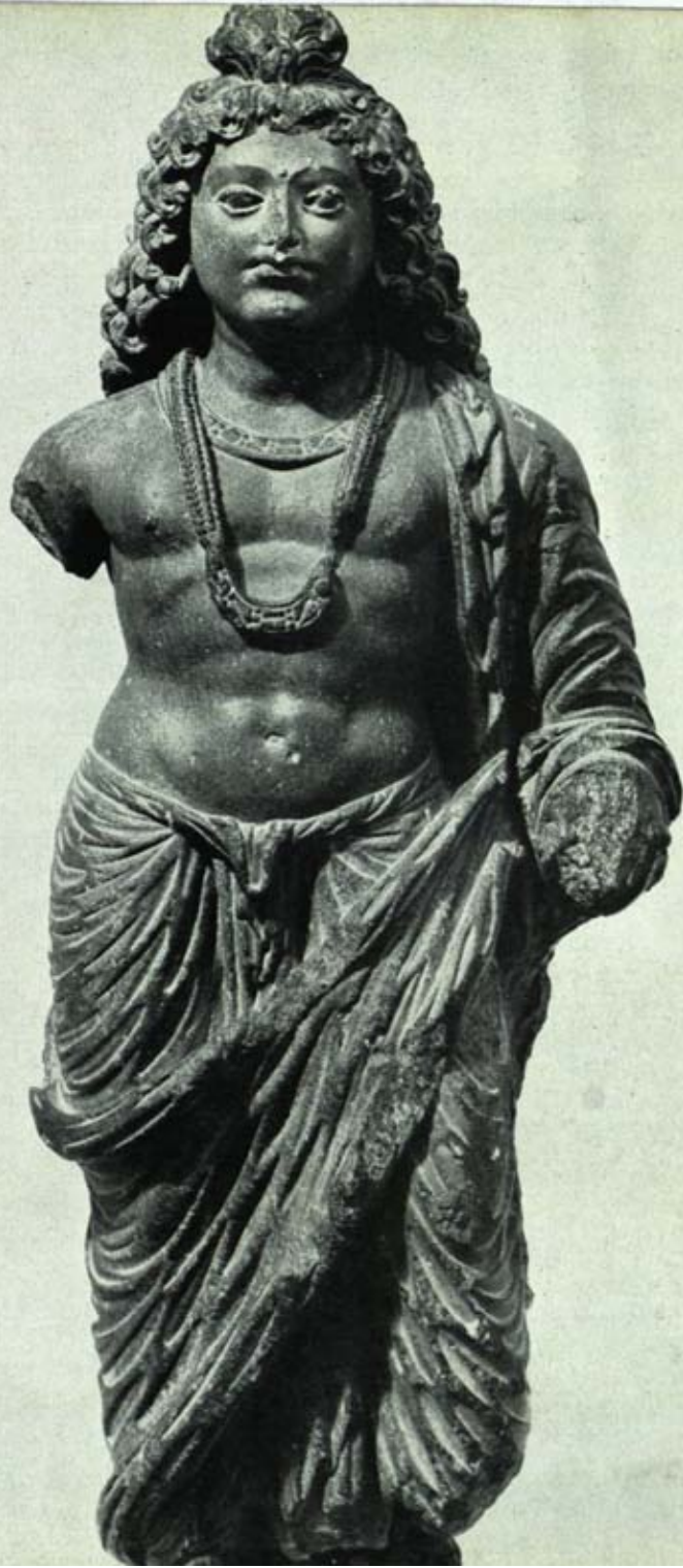
Statuette of a Bodhisattva, perhaps Siddhartha, 2nd-3rd century, schist 18½ x 7½ Lahore, Central Museum