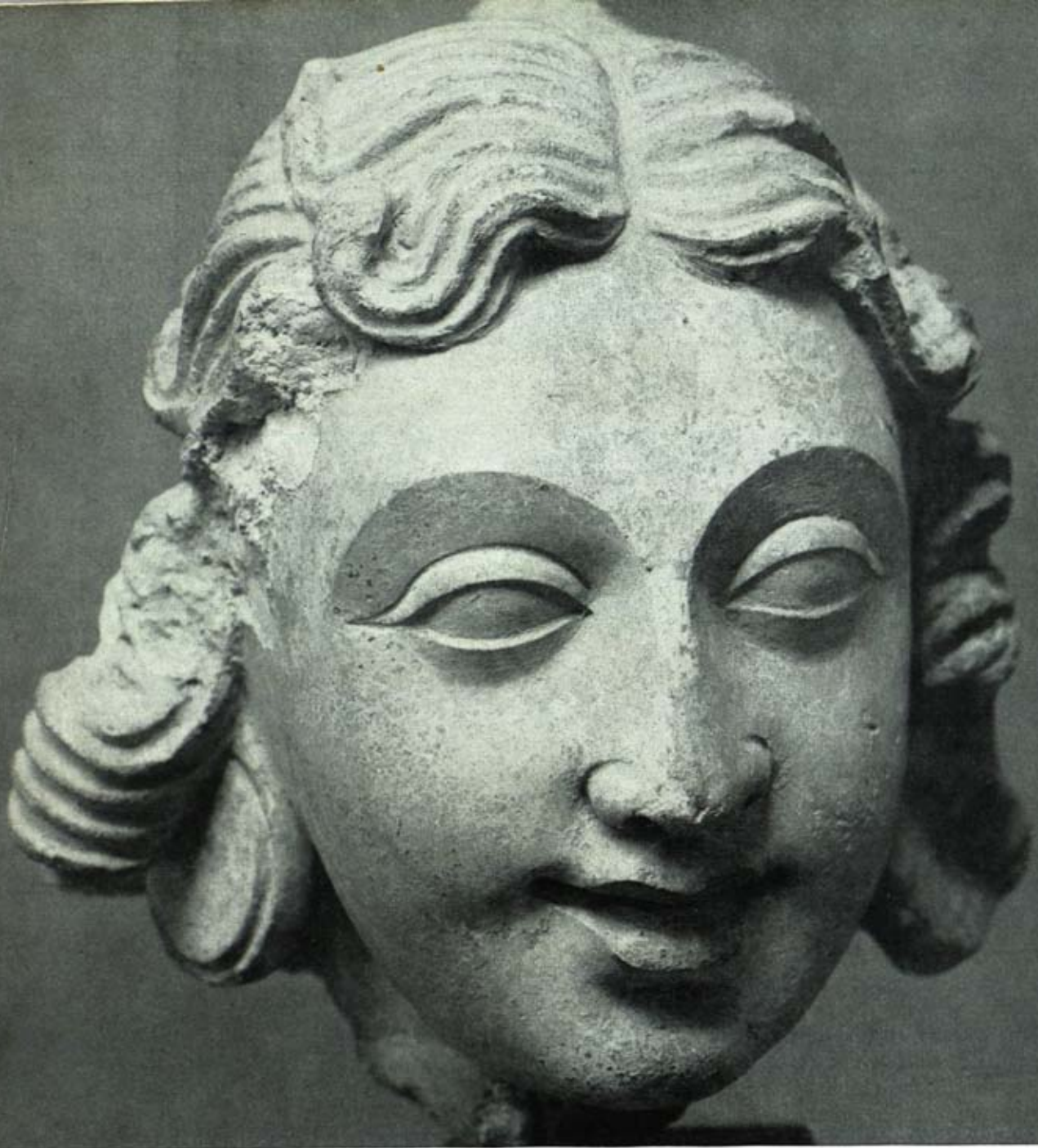
Fig. 11: Head of a Devata, 2nd-3rd century, stucco, height: 7", Museum of Fine Arts, Boston