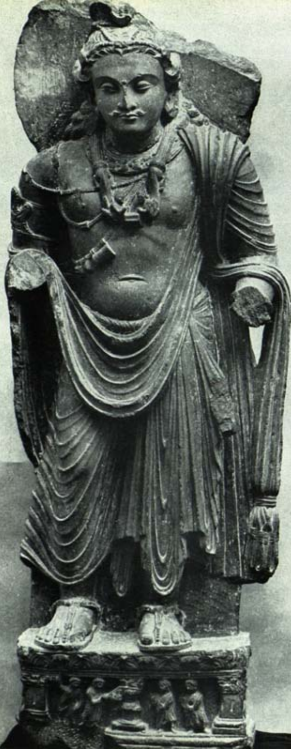
Bodhisattva, 2nd century schist, 40 \frac{1}{4} x 15 Lahore, Central Museum