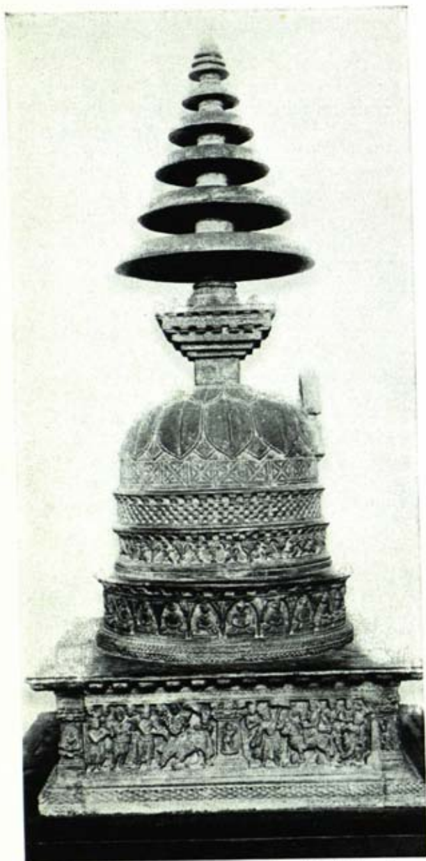
Fig. 14: Miniature Stupa, from Loriyan Tangai, 2nd-3rd century, slate, Indian Museum, Calcutta

or sneaks filling the interstices between these boulders. The relics were embedded in the mass of the building, sometimes in the deepest foundations and sometimes in a chamber on a level with the drum. The Gandhāra stupa differs from its early Indian precedents in that the decoration has been transferred from the railing and toranas to the body of the monument itself. The base and drum of the Gandhāra stupa were completely encased in a sculptural revetment carried out in stucco or lime plaster. The decoration consisted of panels of scenes from the life of Buddha, separated by pilasters of a classical type, or in some of the later stupas figures of Buddhas and Bodhisattvas framed in the niches of a continuous arcade surrounding the body of the monument.