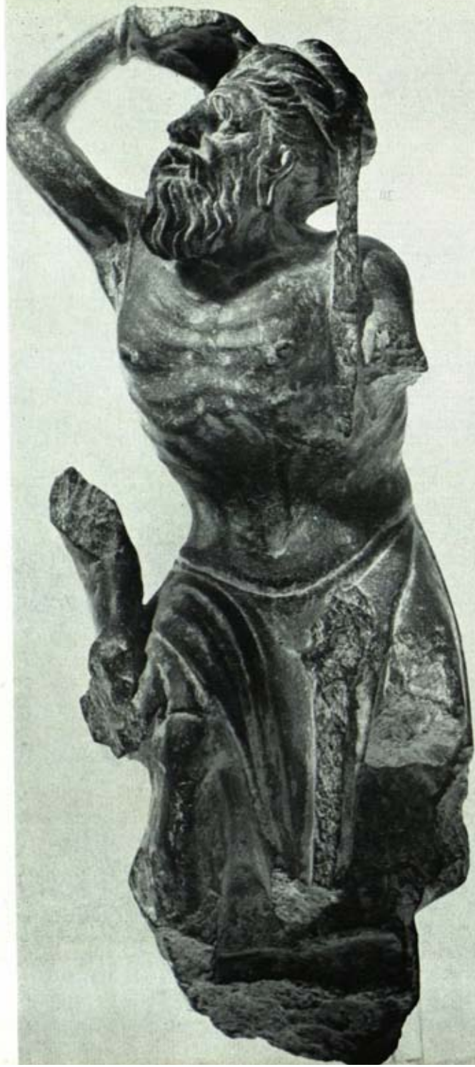
Ascetic, 2nd century schist, height: 10¼" Lahore, Central Museum