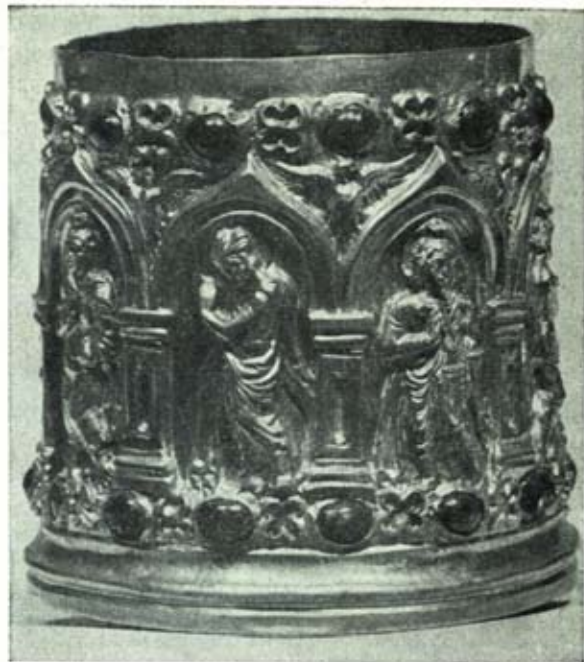
Fig. 8: Reliquary from Bimaran, 2nd-3rd century, British Museum, Calcutta

Important for any discussion of Gandhāra sculpture is the famous reliquary of Bimārān in the British Museum. This gold circular box studded with rubies was found in 1840 by Charles Masson in a stupa at Bimārān in Afghanistan. (fig. 8) The fact that coins of the Śaka king Azes were found associated with the casket has led some scholars to attribute this object to the 1st century B.C. But actually the coins could have been inserted at any time subse-