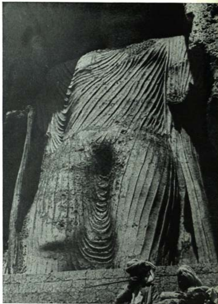
Fig. 5: Buddha (120'), 2nd-3rd century, Bamiyan, Afghanistan

Just as the statue of the deified Roman Emperor may have influenced the anthropomorphic representation of Buddha, so the classical cult of the colossal that began to manifest itself in the giant effigies of Nero and Constantine certainly has a reflection in the giant images of Bāmiyān in Afghanistan. These two colossal statues, respectively 120 and 175 feet high, were carved out of the sandstone cliff and covered with a heavy layer of mud and plaster originally painted and gilded. The 120-foot colossus is an enlargement of a typical Gandhāra Buddha of the 2nd century A.D. (fig. 5) The larger 175-foot statue, with its drapery arranged in string-