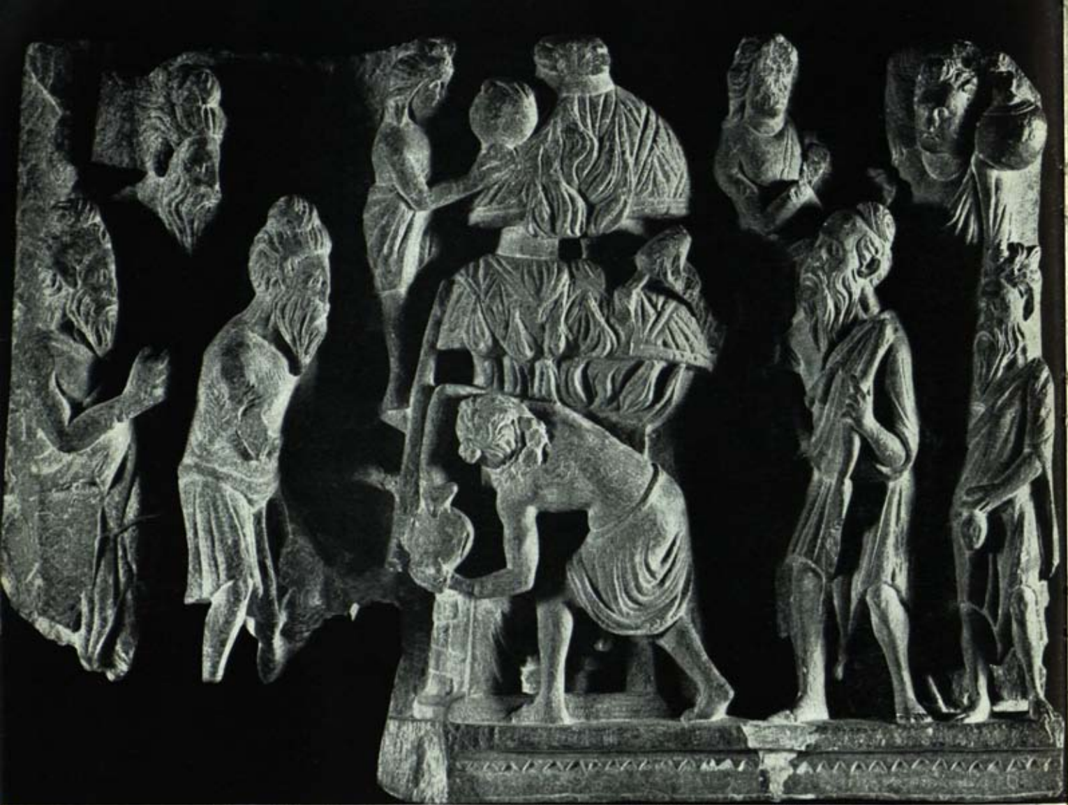
"The Ascetics of the Kasyapa Tribe endeavor to extinguish the conflagration in the Fire-Temple", 3rd century, schist, 23½ x 15¼, Lahore, Central Museum