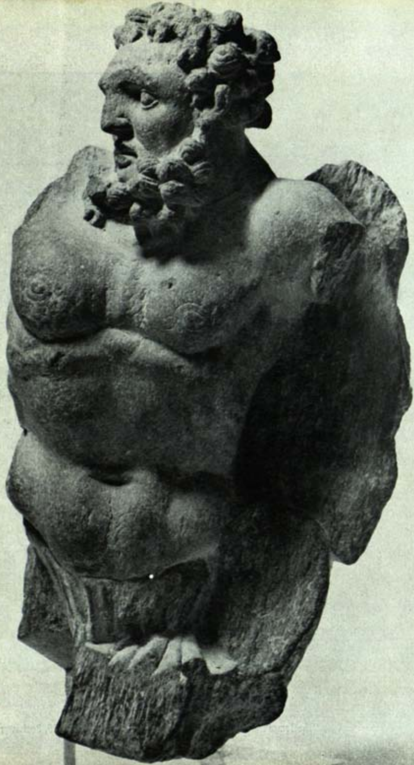
Torso of an Atlantid, from Sikri 2nd-3rd century, schist height: 9 1/8" Lahore, Central Museum