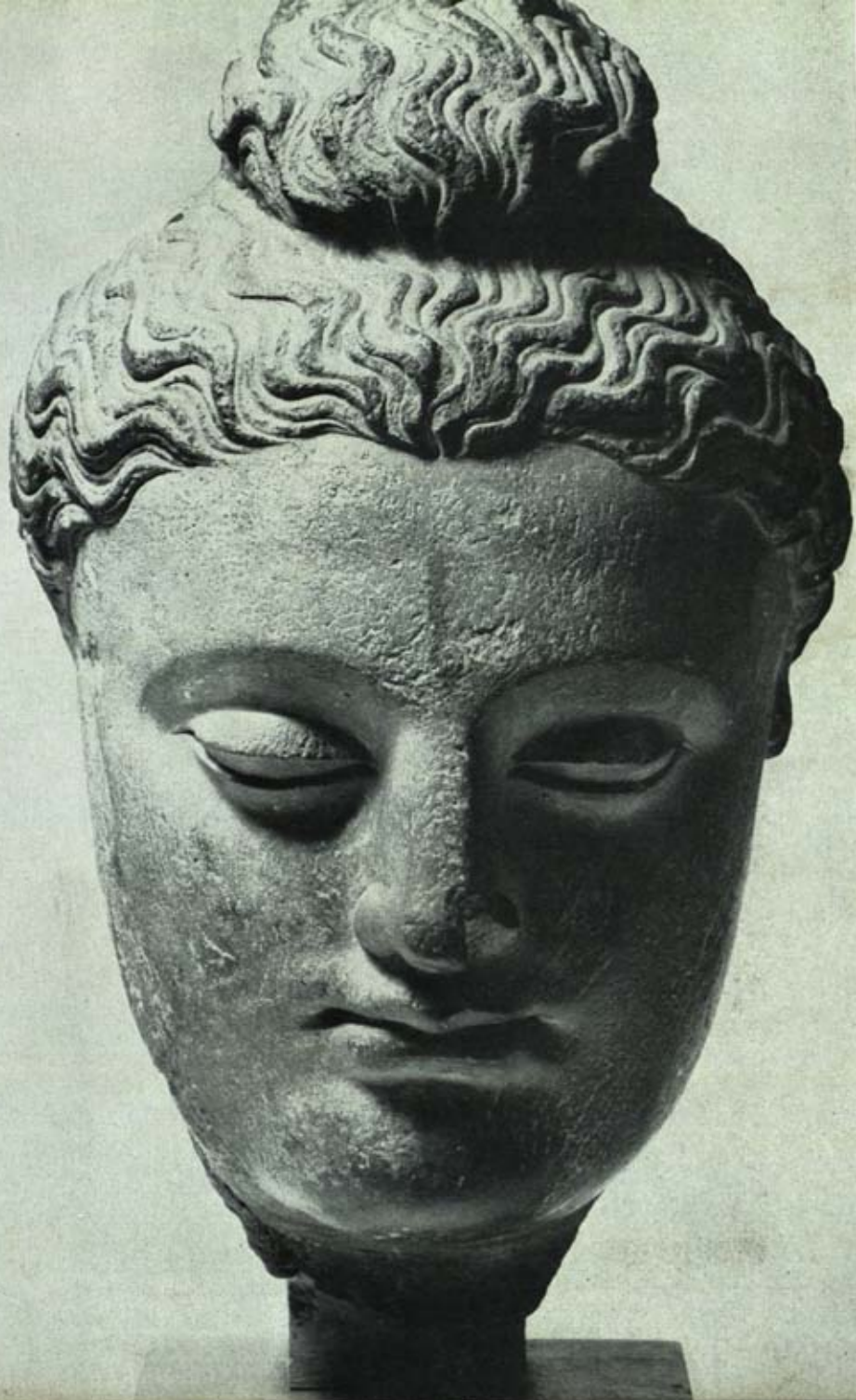
Head of Buddha 2nd century stone, height: 13" Peshawar Museum